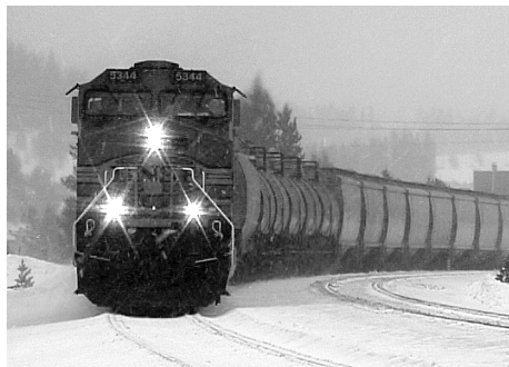
BNSF 9-44CW 5344 lead 4417 and warbonnet 707 on the Denver, CO, to Provo, UT, train pulling into Winter Park Siding, CO, to meet UP 6576 East. Skiers were enjoying the fresh powder on 12/22/01. Train was on UP trackage rights, Moffat Tunnel Subdivision.