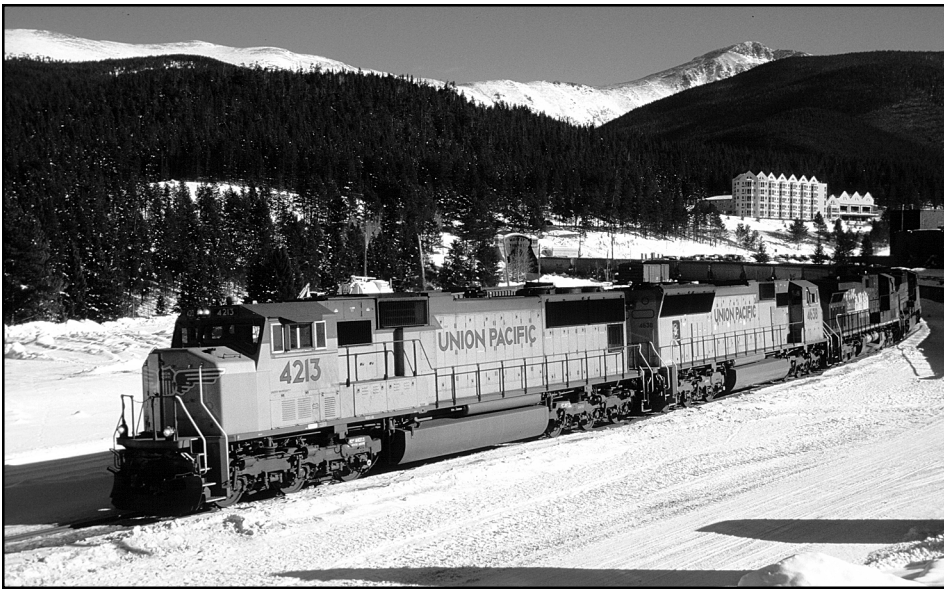
The holidays were observed by the major western railroads with little operating Christmas Day. Wednesday, 12/26/01, found UP's westbound Denver to Roper, UT, train of Dec. 23rd rolling by the Winter Park Ski Resort having just exited the 6.2-mile Moffat Tunnel. First two units were SD70M 4213 and 4638 with flared radiators.

originates out of Gibson Yard. Power usually is relayed to the IHB the night before or early in the morning on the date of scheduled departure. The train headed west to City of Industry, CA, passing Julesburg, CO, 1/8/02 with UP 4711 leading.