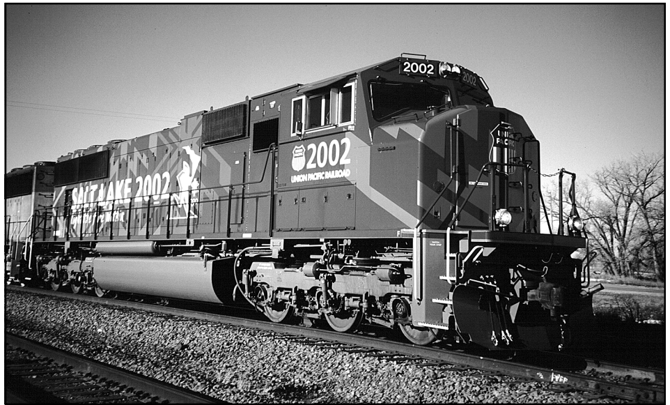
Union Pacific put one of the two Winter Olympic units, UP 2002, on the road during the holidays. UP 2002 spent New Years Day 2002 at Salt Lake City, UT. It rolled east through Julesburg, CO, with an intermodal train from Salt Lake City to Council Bluffs, IA. The train moved across western Nebraska on 1/3/02 with SD60 6066.

Union Pacific’s Olympic units 2001 and 2002 will run in their Olympic colors “for awhile” after the 2002 games. They will eventually be repainted into UP colors and renumbered to their actual road numbers,