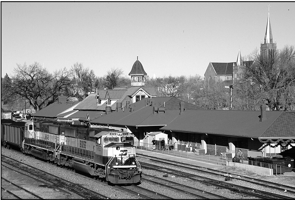
BNSF SD70MAC 9712 and 9648 were moving black diamonds south past the former Denver & Rio Grande Western Railroad's Colorado Springs depot on 12/6/01. Giuseppe's Restaurant has served meals at the old depot since 1973.

existing rail for utility support for the Central Platte Valley line. Bus bridge service was provided on those weekends.